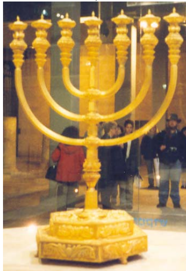
Golden Menorah in Jerusalem, made for the anticipated Third Temple

(Numbers 8:3) There are seven golden lamps, shaped something like teapots, that rest upon the branches of the golden menorah (lampstand). The three lamps on the left face right, and the three lamps on the right face left; so that all six branch lamps face the center lamp, which faces forwards. Each lamp has a hinged lid, which is opened for filling and cleaning; and each has a spout with a wick in it, which is lit with a flame.