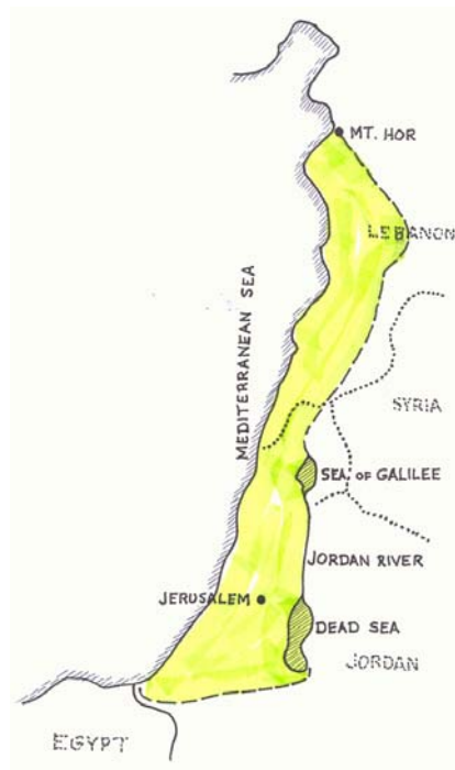
Map of Promised Land

Num 32:33 So Moses gave to them, to the sons of Gad and to the sons of Reuben and to the half-tribe of Joseph's son Manasseh, the kingdom of Sihon, king of the Amorites and the kingdom of Og, the king of Bashan, the land with its cities with their territories, the cities of the surrounding land.