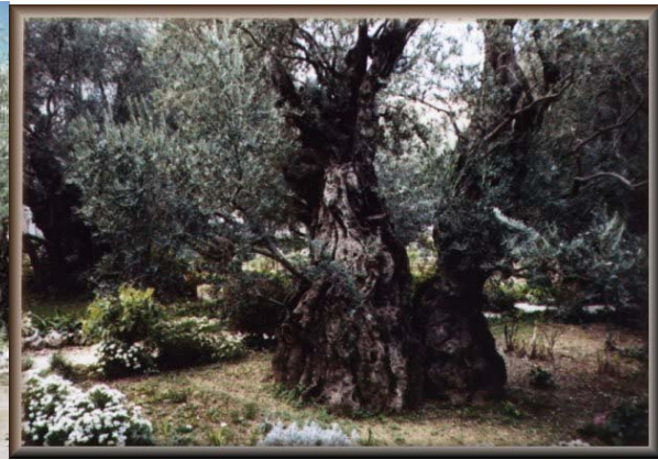
Olive trees on the Mount of Olives in Israel