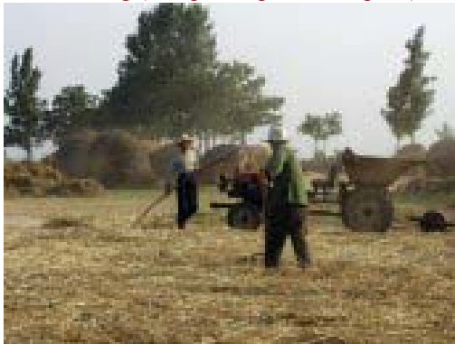
Thrashing (to separate grain from pods)